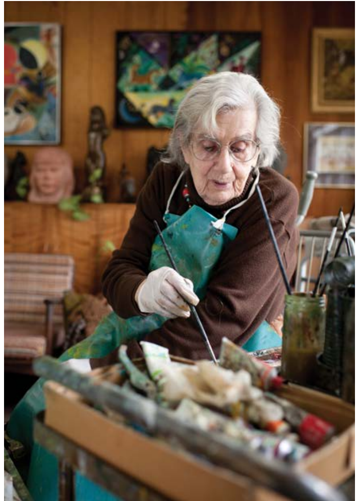
Dahlov Ipcar

Did you also notice the environment that the animals are in? Is this the type of environment you think these animals would live in? Ipcar loved using patterns and shapes to create her artwork and she was inspired by the natural patterns in nature to create her own patterns.