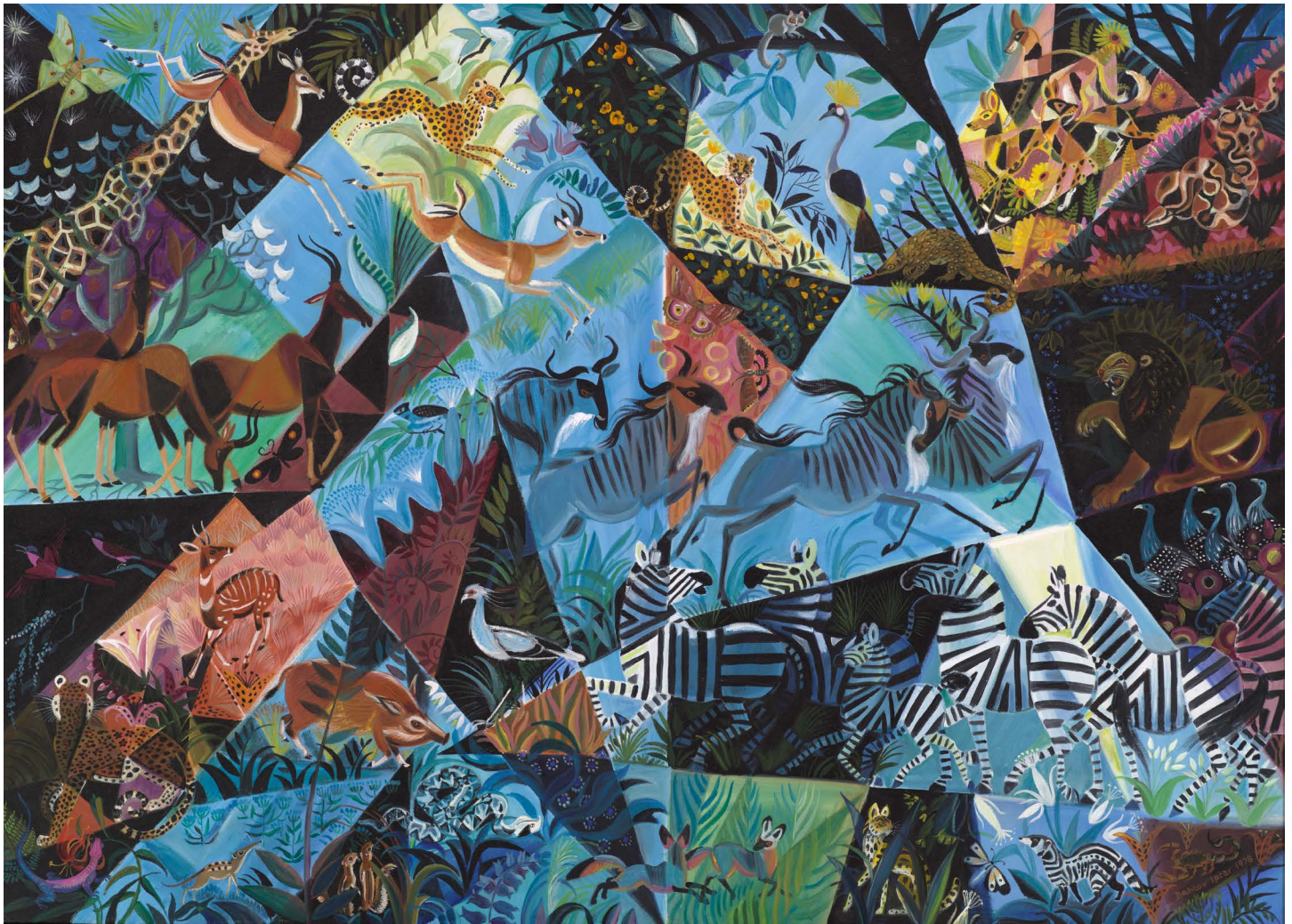
Dahlov Ipcar (United States, 1917–2017) Blue Savanna , 1978 Oil on canvas, 36 1/16 x 50 1/4 inches Gift of the artist, 1987.58